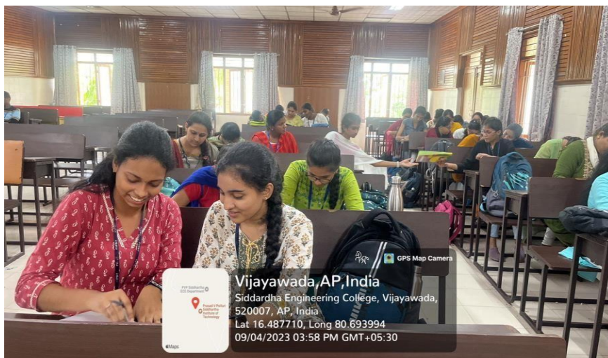
Team discussing about the logo